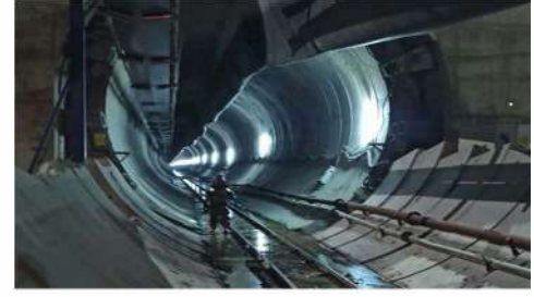
DİYARBAKIR KULP TUNNEL