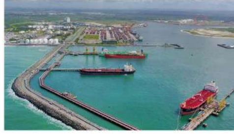
SUAPE PORT EXTENSION