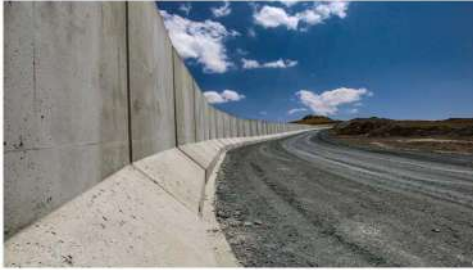
VAN BORDER SECURITY WALL