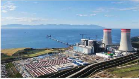
EMBA HUNUTLU THERMAL POWER PLANT