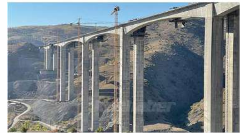
EYİSTE HADİM VIADUCT