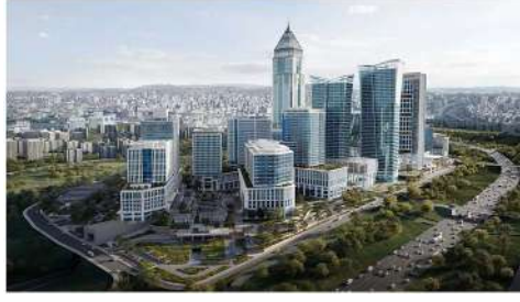
İSTANBUL FINANCIAL CENTER