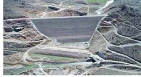
DİYARBAKIR KALE DAM