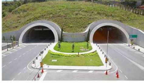
GAZİANTEP ŞAHİNBEY TUNNEL