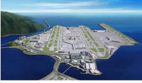
HONG KONG AIRPORT