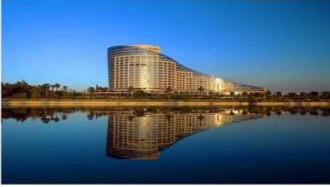
ADANA SHERATON HOTEL