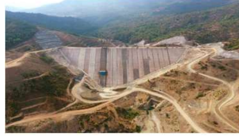
ALANYA GÖKÇELER DAM