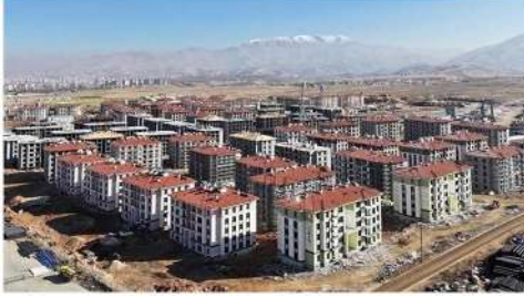
TOKI HOUSING PROJECTS IN EARTHQUAKE REGIONS