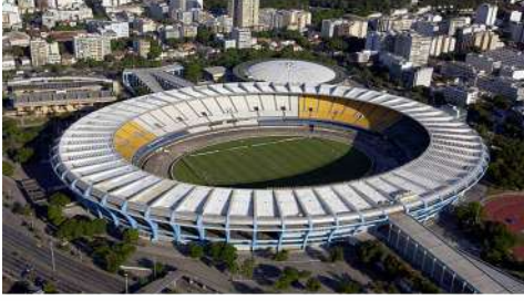
BRAZIL MARACANA STADIUM