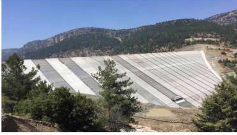
MERSİN SORGUN DAM