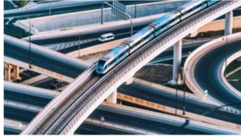
DUBAI METRO PROJECT