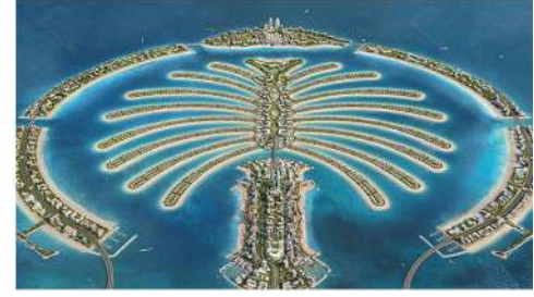
PALM JUMEIRAH PROJECT