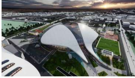
NEW ANKARA 19 MAYIS STADIUM