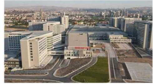
ANKARA CITY HOSPITAL