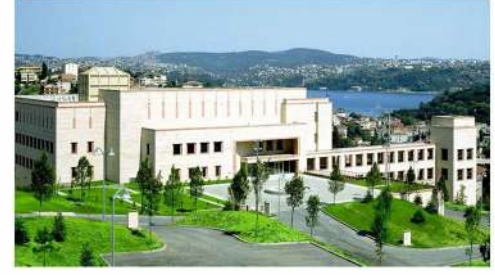
İSTANBUL U.S. CONSULATE