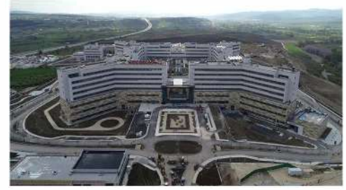
BURSA CITY HOSPITAL