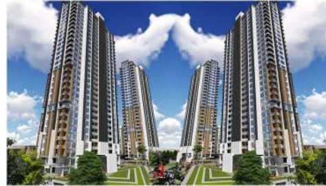
ANKARA ELİT RESIDENCE