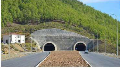
MERSİN AYDINCIK TUNNEL