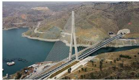
MALATYA KÖMÜRHAN BRIDGE